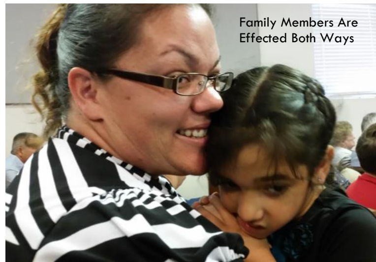
Family Members Are Effected Both Ways