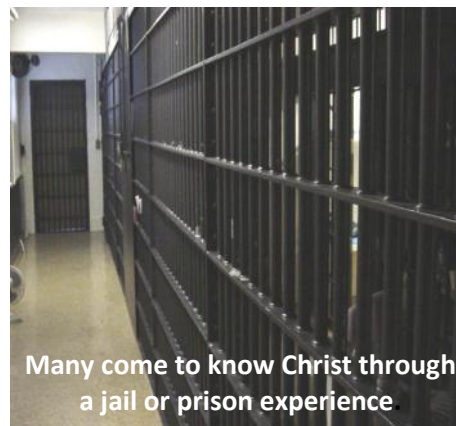
Many come to know Christ through a jail or prison experience