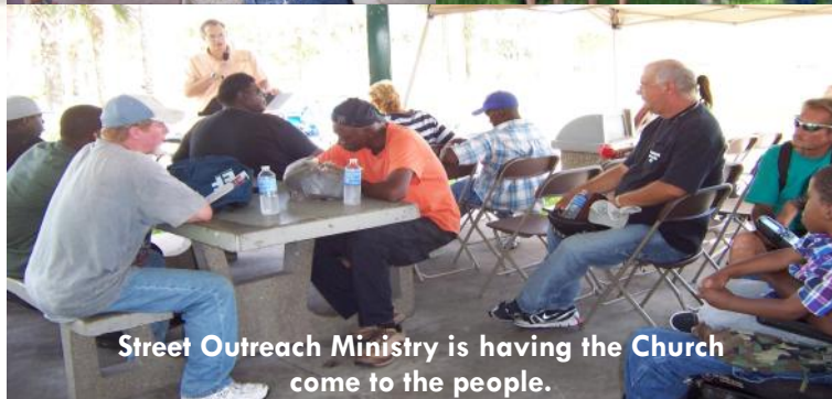
Street Outreach Ministry is having the Church come to the people.