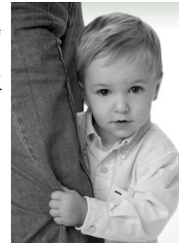
My father didn't tell me how to live; he lived his life as a Godly man and let me watch.